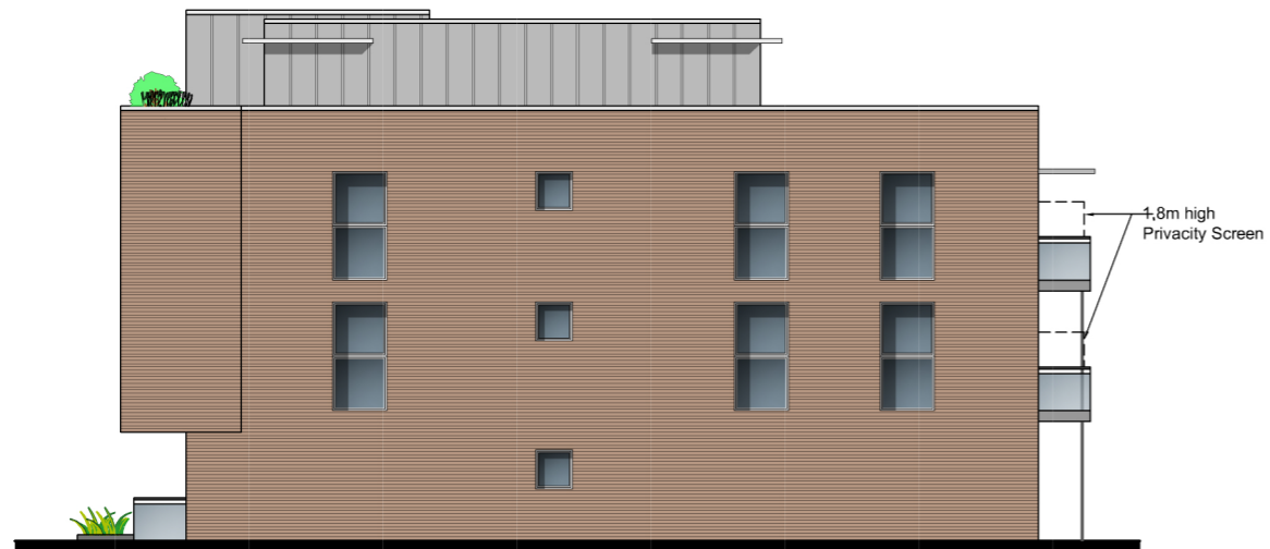
SIDE ELEVATION 4