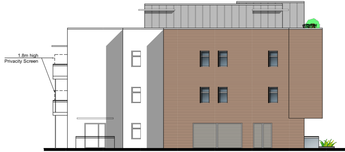
SIDE ELEVATION 2