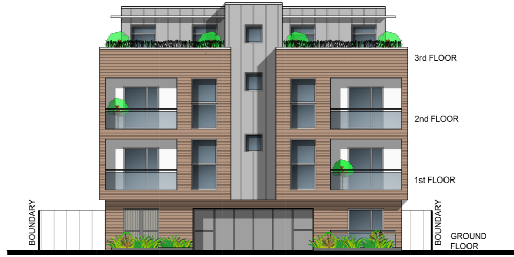
FRONT ELEVATION 1