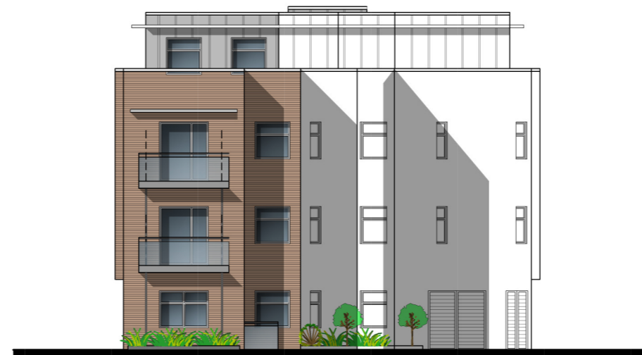
REAR ELEVATION 3